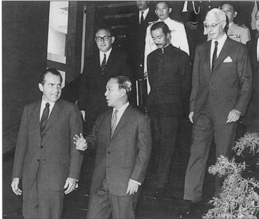
Presidents Nixon and Thieu descend the steps of Saigon's Independence Palace prior to their appearance before the capital city's press corps. Behind them from the left, are Special Advisor to President Nixon Henry Kissinger, South Vietnamese Vice President Ngyuen Cao Ky, and U.S. Ambassador to Vietnam Ellsworth Bunker. President Nixon made an unannounced five-hour visit to South Vietnam (no date given).