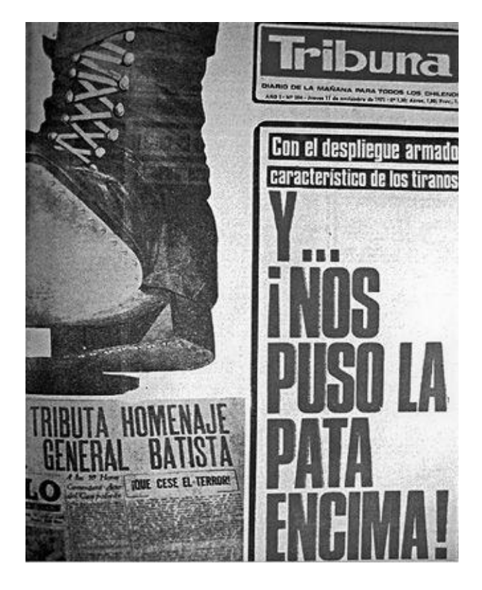
La Tribuna, 11 November 1971.

The Cubans echoed this message. In August, the Chilean press had printed Castro's call for "true revolutionaries" to "abandon romanticism for [the] more humdrum tasks of building [the] revolution's economic and social foundations."<sup>148</sup> Even so, Castro's association with Allende and Cuba's not-so-secret involvement in forming the GAP was increasingly used against the president. Chile's opposition press had falsely accused Cubans of assassinating Frei's minister of the interior, Pérez Zujovic, in June 1971, and this event had radicalized sectors of the Christian Democrat